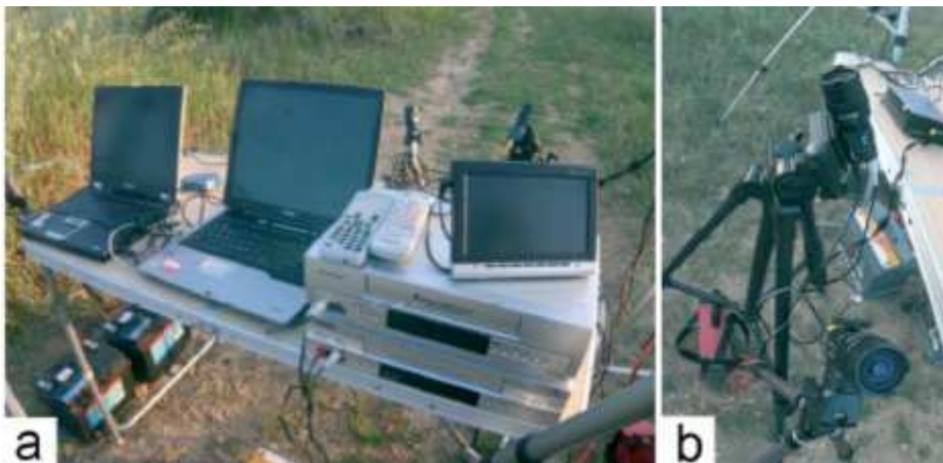
Figure 2.— A mobile SPMN recording station. a) System control table. b) Different sound and video detectors.