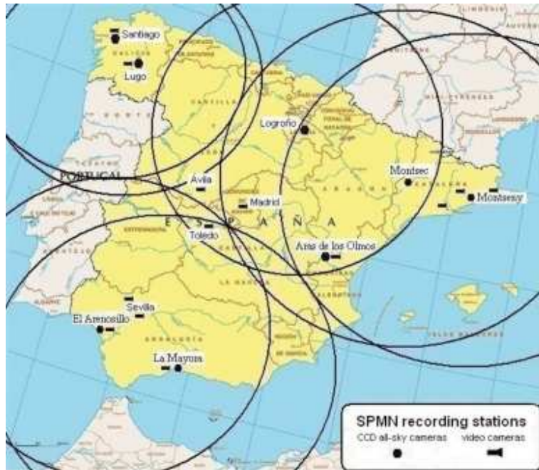
Figure 1.— The SPMN stations currently operating with the different imaging systems that are being used also shown. The circles represent the 400-km wide fireball detection areas optimally covered from each station, although the detection limit for bright bolides is about 550 km.