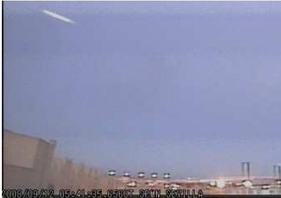
Figure 4.— A daylight fireball imaged with a color video camera from Sevilla SPMN station. The event took place on Sept. 12, 2008 at 5h41m35.6s UTC.